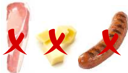
DON'T feed high fat foods