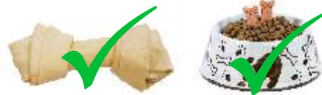
Feed low fat foods